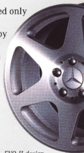
EVO II design 17-inch alloy wheel.

the E 500 Limited something special. But it is good to know that there are only 499 other enthusiasts who can call one their own.