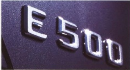
The E 500 Limited - only 500 will ever be built.

As its name reveals, the E 500 Limited will always be a rare bird. To be more precise, when the 500th unit of this type has rolled out through the factory gates,